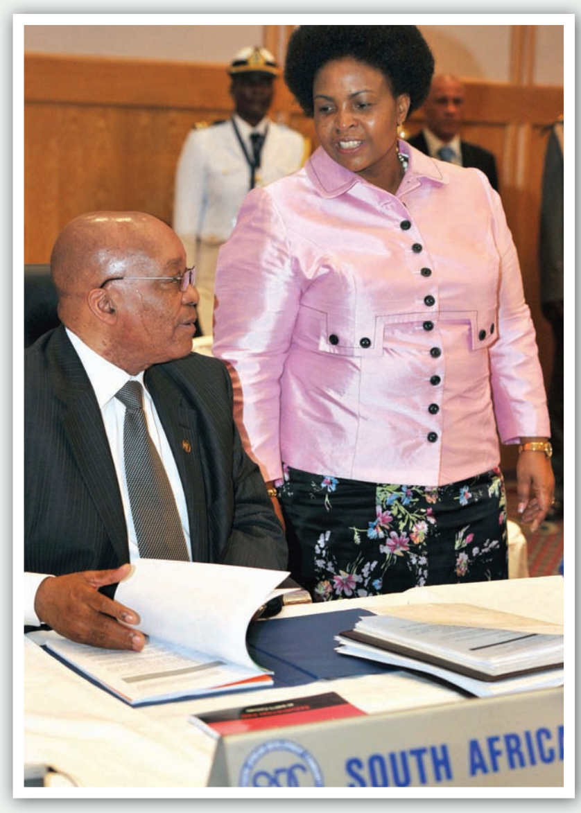
President Jacob Zuma and Minister Maite Nkoana-Mashabane at the SADC Summit

Having been instrumental in the development of the African Peer Review Mechanism (APRM), we remained convinced that it is a unique system of self review by African peers. We remain supportive of the APRM, as we believe it holds the potential to enhance the popularization of these progressive values in our continent.