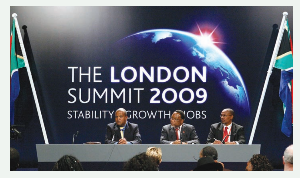
Deputy President, Kgalema Motlanthe addressing media at the close of the London Summit at the ExCel Arena in London, UK

We continued to find more creative ways of strengthening our capacity to tap into economic diplomacy opportunities here at home and abroad through our Missions, including improving the marketing of our country and Africa. Having noted the importance of communicating with both our internal and external audiences, we have prioritized communication of our foreign policy positions and preoccupations using our public diplomacy tools.