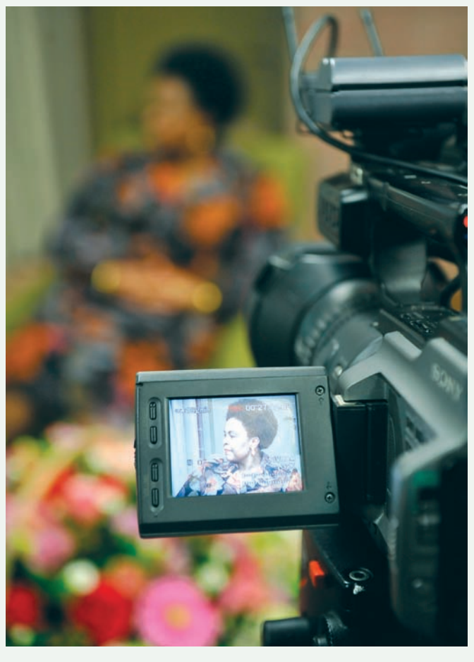
Minister Maite Nkoana-Mashabane being interviewed by the media, OR Tambo Building