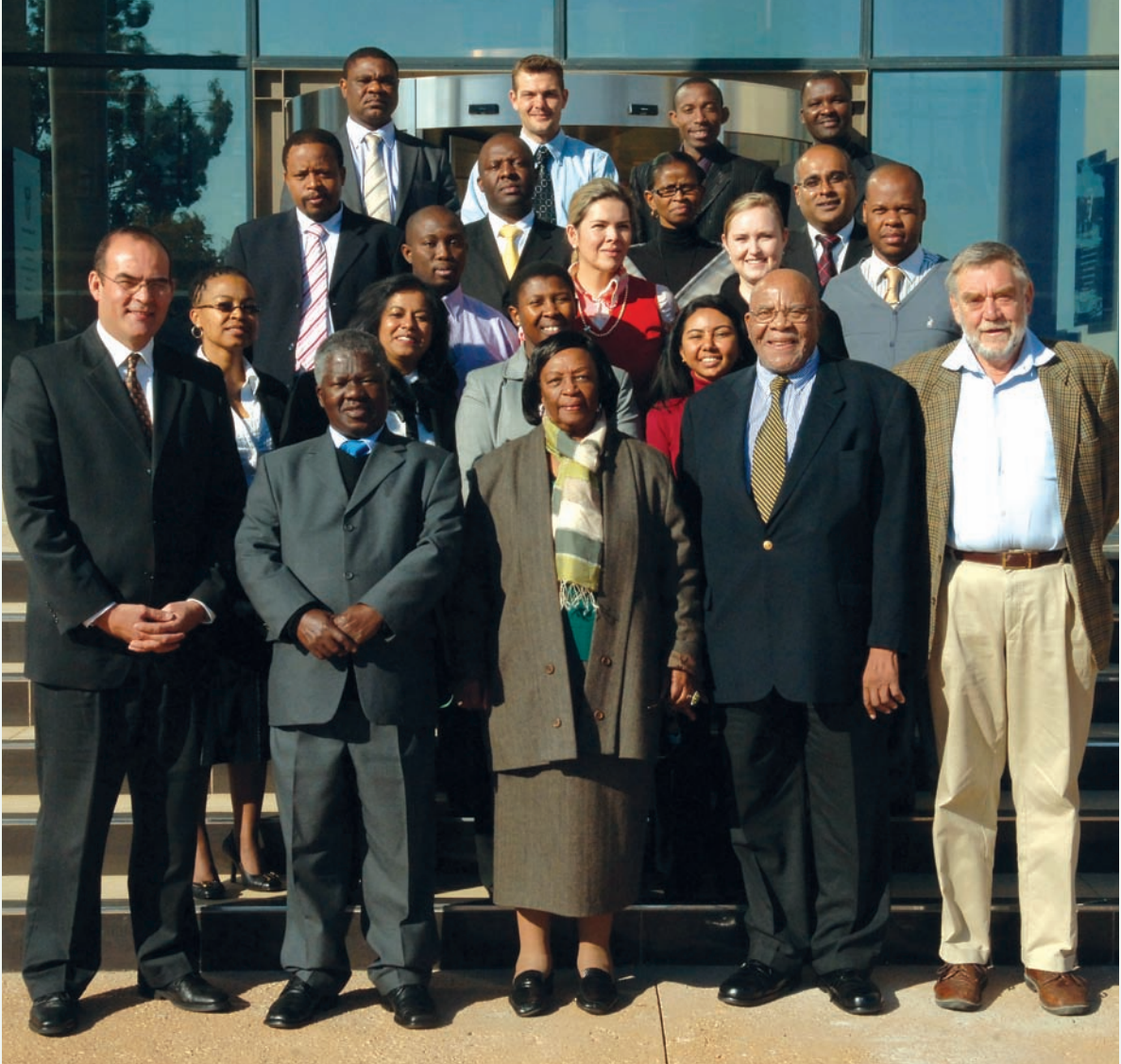
The Diplomatic Class of 2010 (first group) Class of OR Tambo with their facilitators

The Diplomatic Academy has increased the Foreign Language training offered to the public sector and established an Inter governmental Forum with a steering committee to consider areas of foreign language training and interpreting and translation within the public sector & state agencies. Answering the call to job creation and skills development the Department's Cadet programme offered 52 unemployed graduates a chance to further their learning and pursue their career in the Department. In addition, the Department enrolled a second group of senior officials in the Masters in Diplomacy Programme to further enhance the skills profile of the senior management dealing with international relations in the public sector.