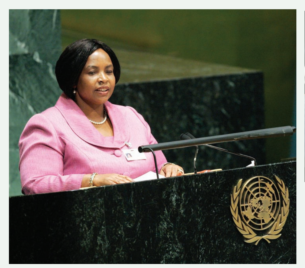
Above: Minister Maite Nkoana-Mashabane addressing the United Nations Conference on the World Financial and Economic Crisis and its Impact on Development.

Above right: Deputy Minister Ebrahim Ebrahim participating in the UN Security Council